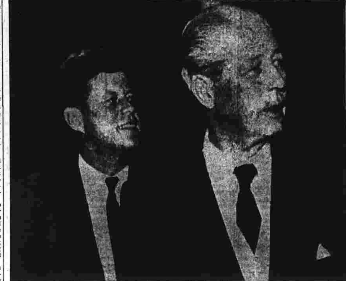
President Kennedy and British Prime Minister Macmillan are shown after their talks ended today.